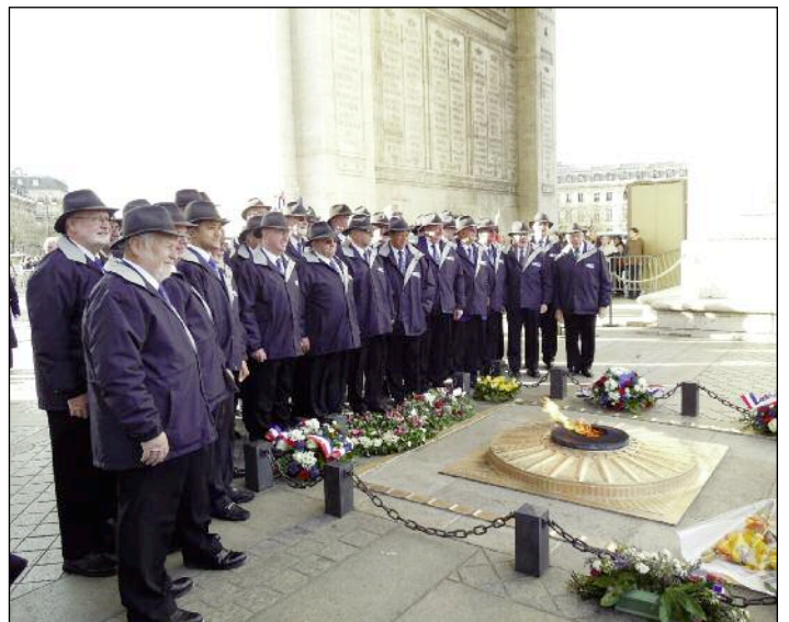
KEEPING WARM: The Australian male choir keeping warm and paying their respects in France.

The choir's last performance in France was with a choir of Polish miners at Douai.