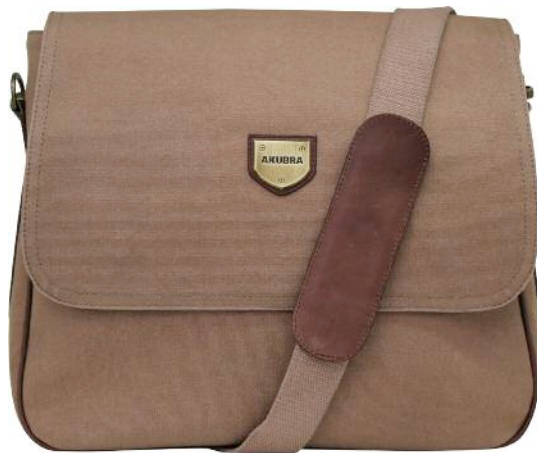
NEW PRODUCT: The Nepean Messenger Bag, part of the new range.

"I was amazed at how many calls we fielded at the factory. This clearly demonstrated the impact of the media promotion, especially