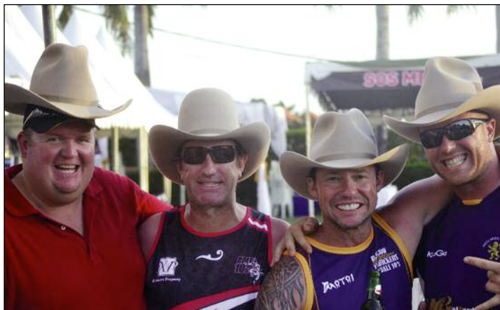
BUSHWACKED: Four of the Bushwackers rugby team showing their Akubras a good time.

And the only time those Akubras came off their heads, in the daylight hours anyway, was when they ran on to the field to play.