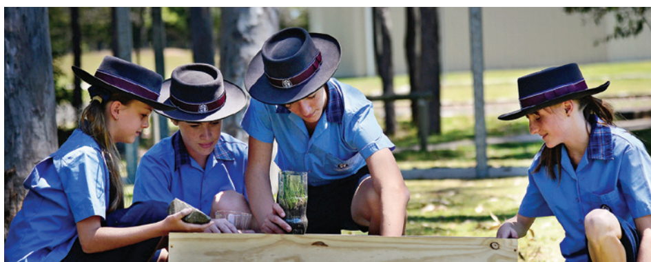
Students at Fraser Coast Anglican College in their Akubras

There are different kinds of Akubras, you can see that the teacher version is different to yours. One of the most famous versions is the ‘Arena’