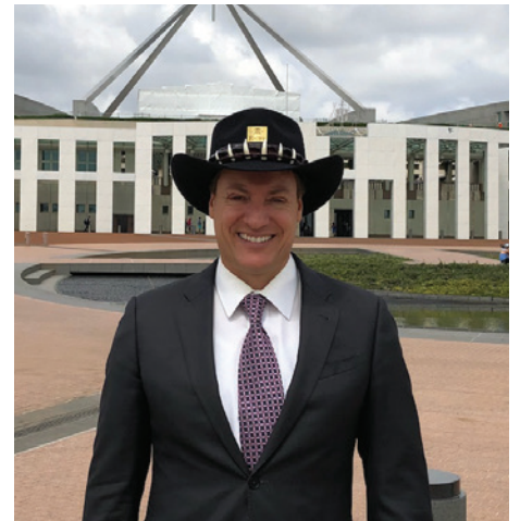
Left: Ross Vasta MP, outside Parliament House Canberra

Liberal Party Federal Member Ross Vasta is a loyal supporter of Akubra Hats – and is particularly conscious of the impact of melanoma after recently having three moles removed from his scalp. Being based in Queensland, Akubras' are a must.