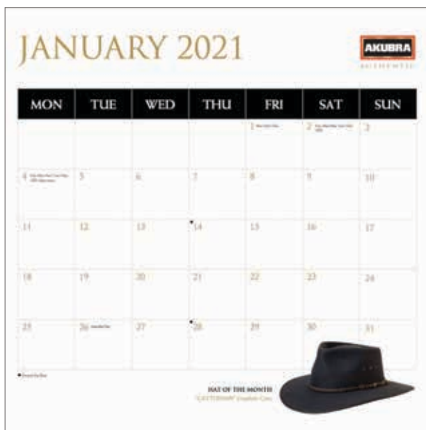
Our 2021 calendar