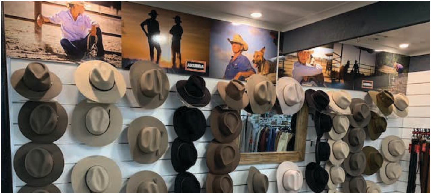
The new display at Hastings Co-op Department Store, Wauchope

The iconic Akubra brand is proudly on display at the Hastings Co-op Department Store in the regional NSW town of Wauchope, not far down the road from the Akubra factory in Kempsey.