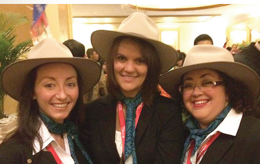
PERFECT FIT: Three of Australia's delegates wearing their Akubras with pride.

Akubra is a name synonymous with Australia and Tupperware is a company that is synonymous with most Australian households.